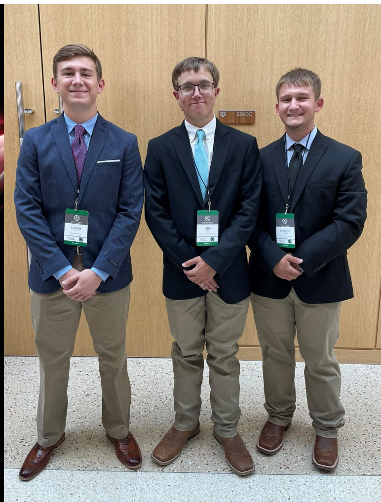
Our three Texas 4-H Foundation scholarship winners recognized at the Texas 4-H Roundup this evening at the scholarship reception! Way to make Burleson County proud!