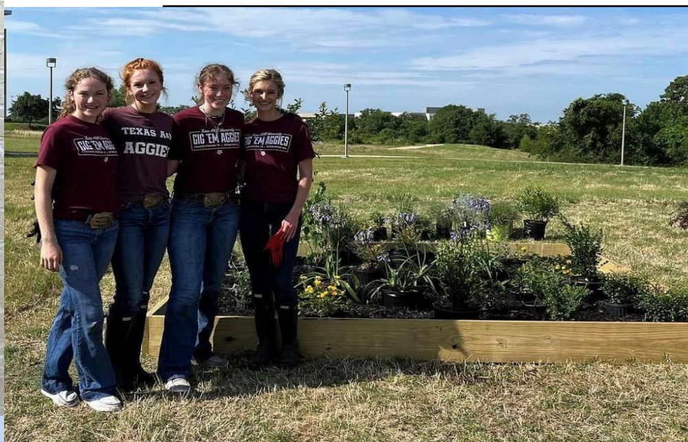
Congratulations to our Landscape team for winning the Texas 4-H Landscape Design put on by the TAMU Horticulture Department! Way to go!