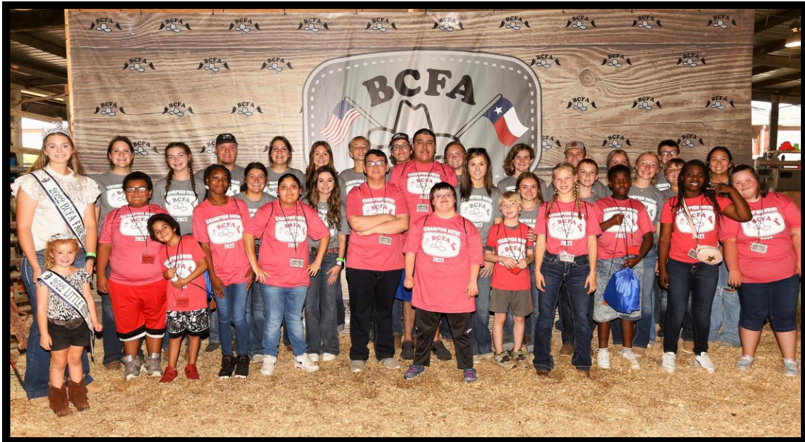
2022 Champion Drive Participants & Buddies