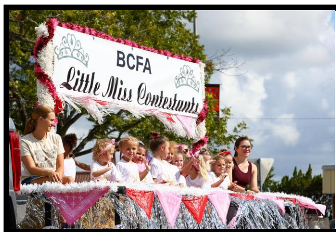
LITTLE MISS CONTESTANTS